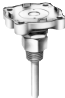
Direct Mount 1/2" NPT