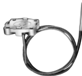
Capillary and Bulb