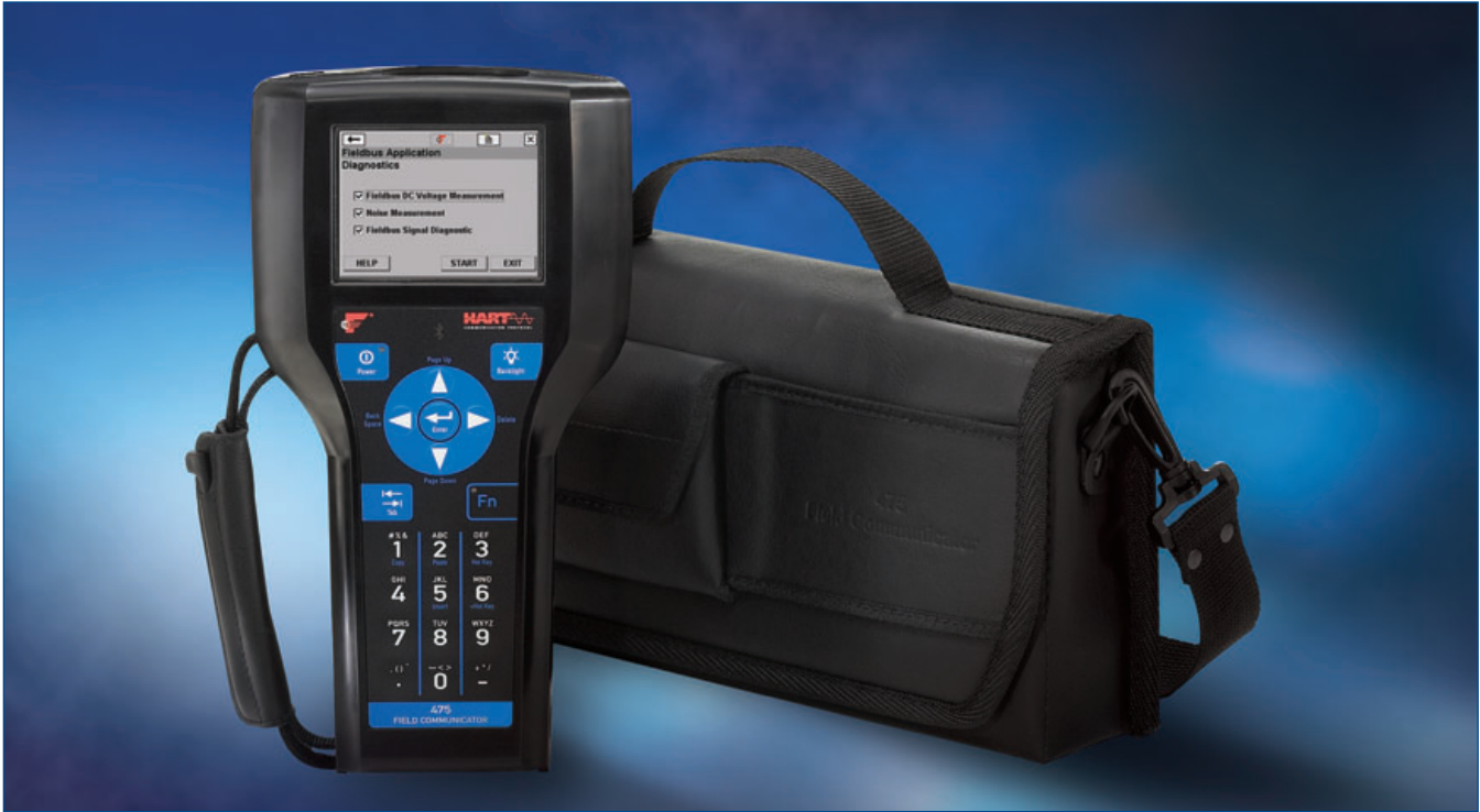
The 475 Field Communicator, with its handy carrying case, provides a single tool for configuring and diagnosing HART and FOUNDATION fieldbus devices.