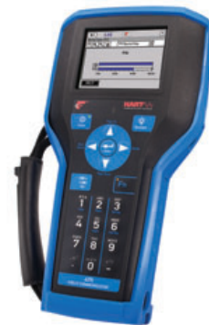
The protective rubber boot provides added protection in the field.

The 475 Field Communicator is designed, manufactured, and tested to very demanding specifications. It is ready to go wherever you need to go to get the job done.