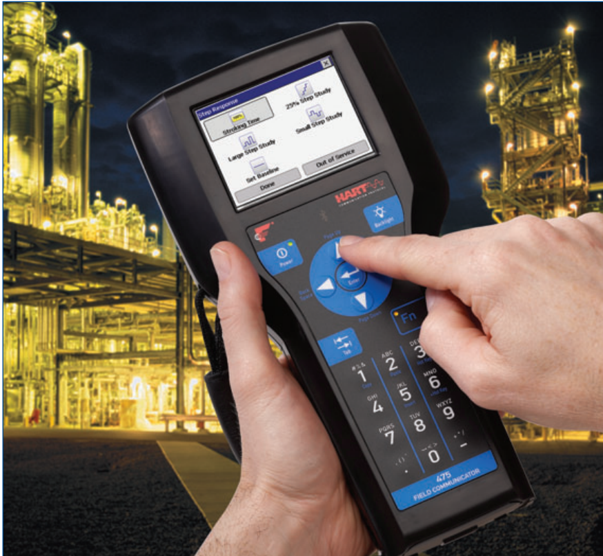
Gain advanced diagnostics in the field through ValveLink Mobile and enhanced graphics.